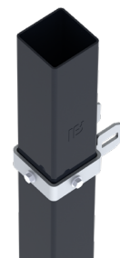
All Around Bracket